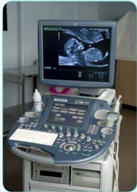
Ultrasound machine used by sonographers during a scan

You will be asked to drink some water before attending for the scan so that you have some fluid in your bladder. This helps the sonographer record better pictures of your baby. The amount of water that you will be asked to drink will depend on the stage of pregnancy. You should have a full bladder for the early pregnancy scan, so should drink about a pint (around 500ml) an hour before the scan. Your bladder does not need to be full before the mid-pregnancy scan, but drinking a glass or two of water will help the sonographer.